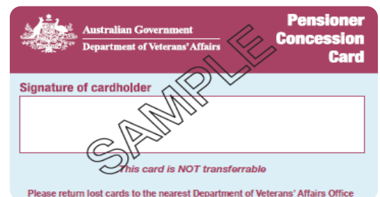
Queensland Pension Card DVA (front and back)