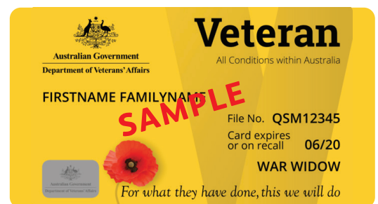
War Widow Veteran (new version front)