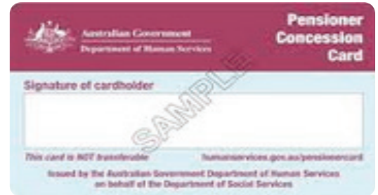
Queensland Pension Card (front and back)