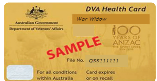
War Widow Veteran (older version front)